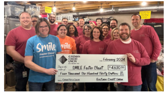
SMILE Foster Closet was one of eleven charities receiving a check from ECU employees.