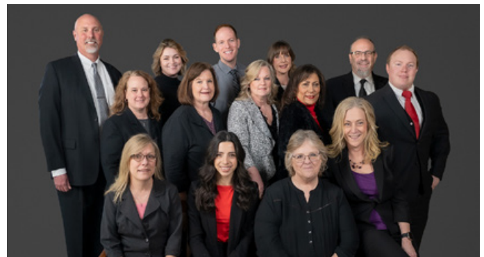
Current ECUTE Staff.