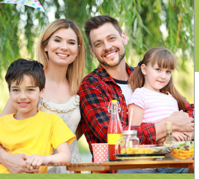
Newsletter for Members • June 30, 2024